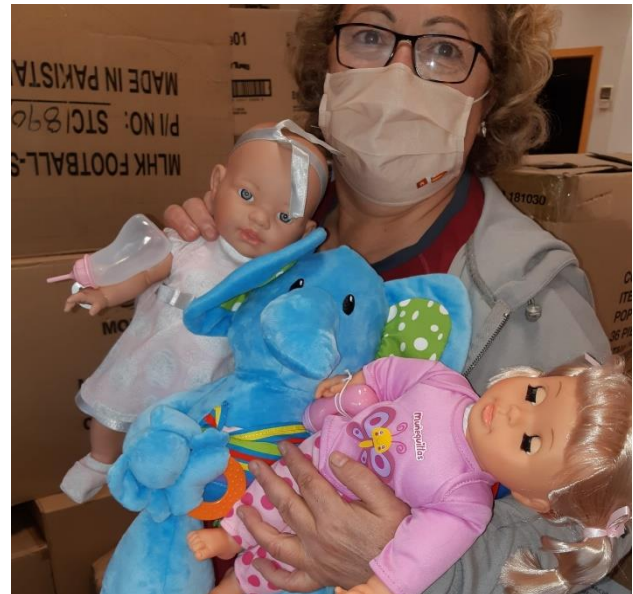
Donation of toys that will arrive in Athens in January 2021.

Thanks to Pampiraiki for the donation of juice, biscuits and baby food. To Gortex for the 1000 jackets you sent and to We Act for Sweden for the food and clothing truck unloaded on the 3rd of last month. To Belinda , from Germany, who sent a pallet that will arrive on the 9th with blankets, nappies, food and hygiene products. And to Negia for the pallets of juice.