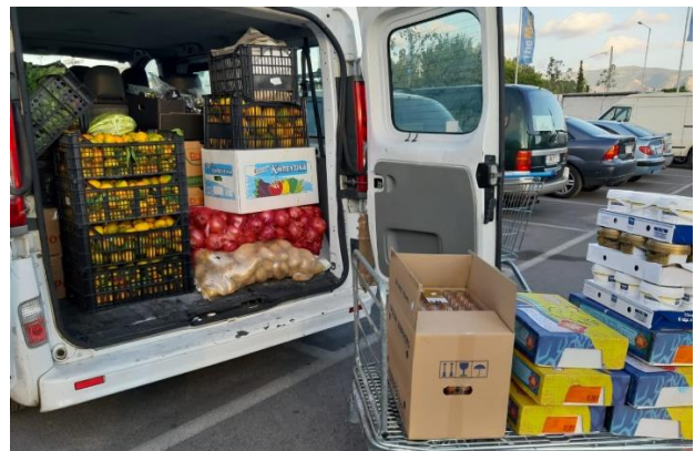
Purchase of fresh food thanks to the financial donations we receive.

The 12D platform is preparing nation-wide mobilisations to protest against the new Migration and Asylum Pact. To contact them: plataforma12D@protonmail.com