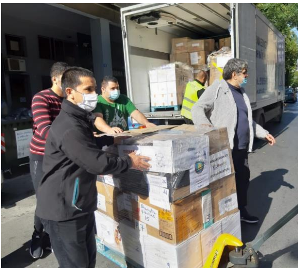
Arrival of the pallets from the containers received in November at the Athens warehouse.